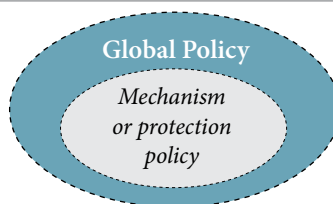
FIGURA 1: MECHANISM AND GLOBAL POLICY

Existing protection mechanisms for at-risk HRDs should be just one, albeit an important, component of a broader and more integral focus that should characterise public policies on the right to defend human rights.