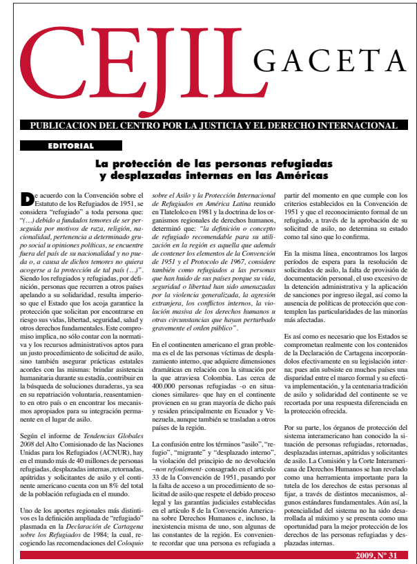
Front cover of an issue of the Gazette. The editorial for this issue focuses on the protection of refugees and internally displaced people in the Americas.