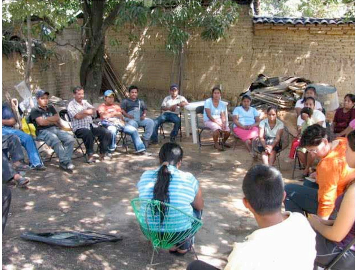
Representatives of indigenous human rights organizations, in the Mexican State of Guerrero, rallying in support of two women who were raped by members of the military.