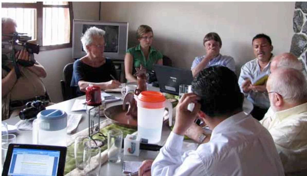
Members of the International Observatory on the Human Rights Situation in Honduras listen to the testimony of human rights leaders, who were the target of abuses during the coup d'Etat.

Along with US civil society organizations, such as the Washington Office on Latin America (WOLA) or the Open Society Institute, it coordinated efforts in the Washington D.C. area to provide technical legal opinions to decision-makers from Congress and Government. CEJIL participated in a meeting with the Director of the Legal Library of Congress to clarify why one of its reports defending the legality of the coup d'Etat was mistaken.