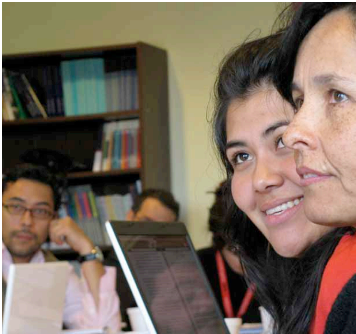
Human rights defenders from all over the hemisphere participated in the bi-annual meeting of the International Coalition of Organizations for Human Rights in the Americas, held at CEJIL's headquarters in Washington D.C. in October 2008.