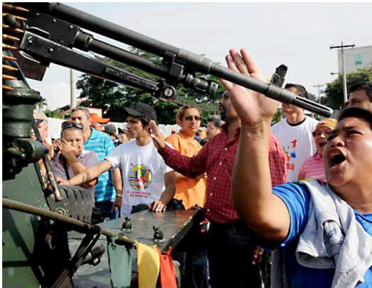
Demonstrators in the streets of Tegucigalpa peacefully protest against the deployment of military tanks as a result of the Coup d'Etat in Honduras Photo: N/A

The day of the coup, CEJIL issued a joint Statement signed by another 70 civil society organizations, from 17 countries, condemning the disruption of the constitutional order and asking the IACHR to adopt precautionary measures to protect the physical integrity of those who were being persecuted by the de facto Government. From July 17 to 26, CEJIL was part of the mission of the International Observatory on the Human Rights Situation in Honduras (OISDHHN), made up of 17 organizations from the Americas and Europe. It conducted on-the-ground verification of gross human rights violations, such as the deaths of demonstrators opposed to the coup, the excessive