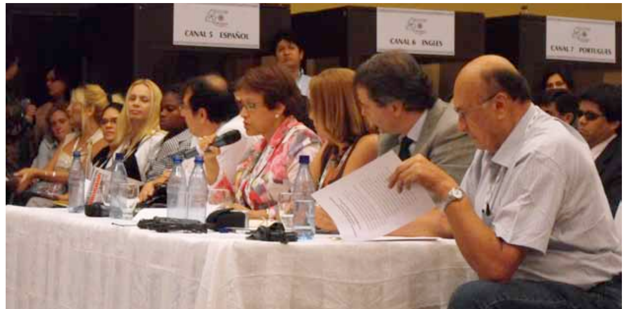
At the OAS General Assembly in San Pedro Sula, Honduras, in June 2009, human rights defender organizations of the Americas highlighted how the failure by States to comply with the judgments of the I/A Court H.R. undermines the Inter-American system.

CEJIL also closely followed discussions on the reform of the structure of the Meeting of Competent High-Level Authorities on Human Rights and Foreign Ministries of MERCOSUR (RAADDHH) in the context of the newly created Institute of Public Human Rights Policy of MERCOSUR and the latest UNASUR Declaration of Quito expressing the intent to create a South American Council of Human Rights.