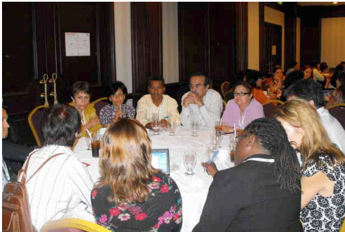
Human rights defenders reach a consensus on the items to be submitted to OAS Secretary General Jose Miguel Insulza, during the organization's General Assembly in San Pedro Sula, Honduras, in June 2009.