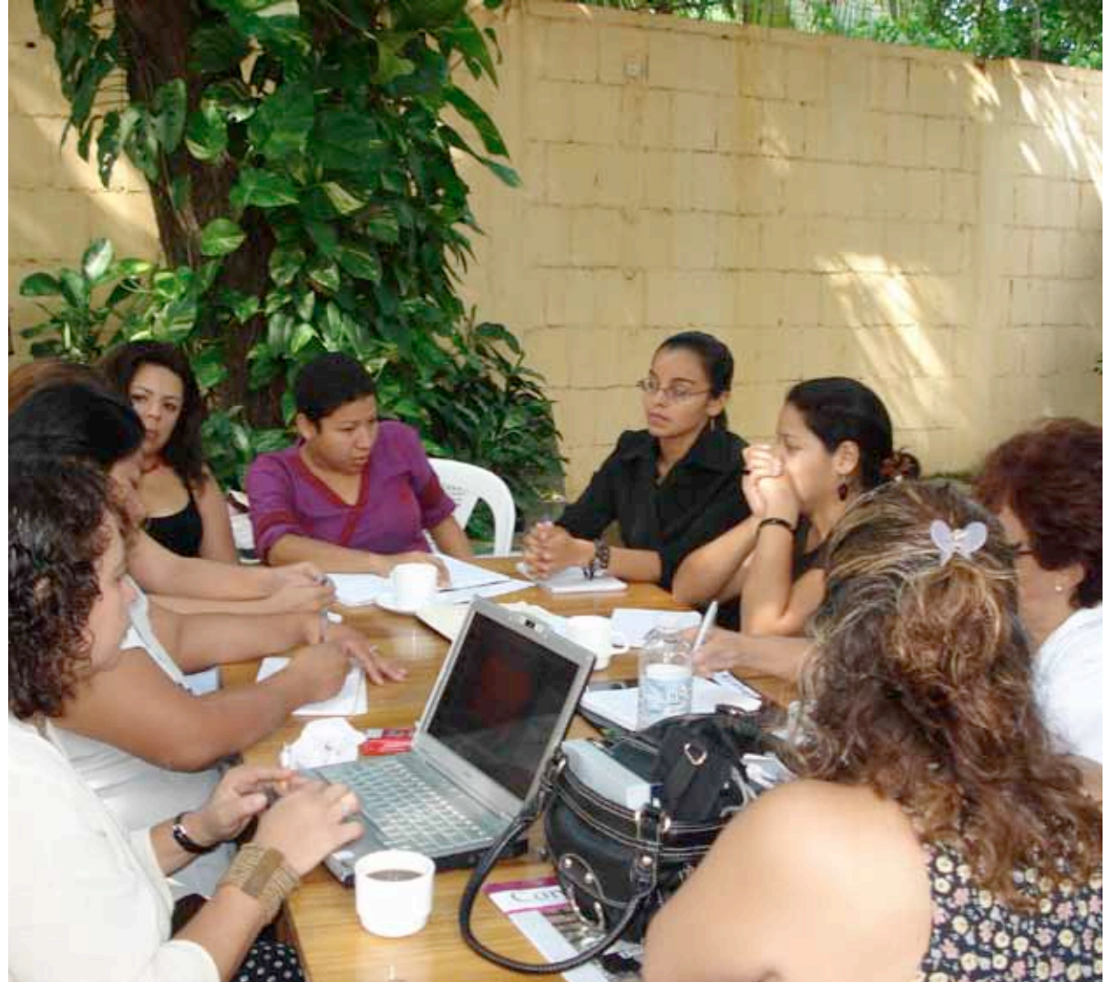
Women human rights defenders from Nicaragua hold group discussions during one of the sessions of the international seminar "Why the Life of Every Woman Counts" jointly sponsored by CEJIL in Managua, Nicaragua, in September 2008.