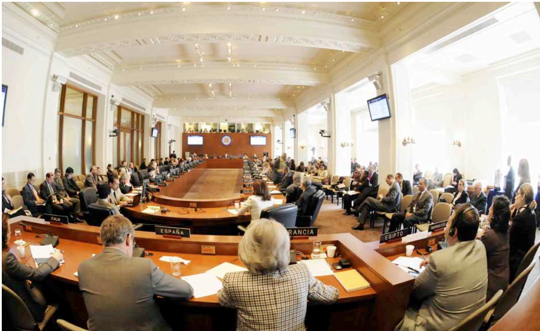
A fund is available in the Inter-American System to help defray the expenses of low income human rights violation victims. In 2009, the OAS Permanent Council approved the regulations on the operation of the Legal Assistance Fund, an initiative spearheaded by CEJIL since 2006.