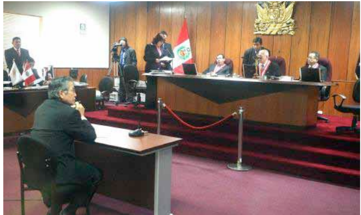
CEJIL was an international observer during the trial of ex President Alberto Fujimori before the Special Criminal Chamber of the Peruvian Supreme Court in November 2009.