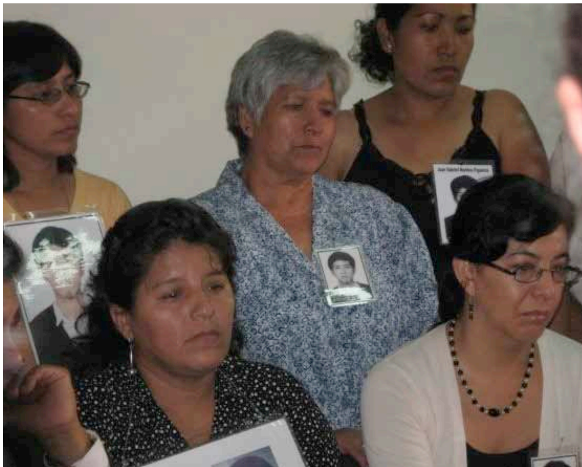
Family members of the victims of human rights violations under the Fujimori Government and human rights defenders take part in a press conference during the trial in which the former President was convicted.