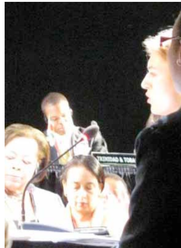
During the Fifth Summit of the Americas, held in Trinidad and Tobago in May 2009, CEJIL helped to coordinate civil society organizations to further enrich discussion and get their proposals on the agenda.

CEJIL and the International Coalition of Organizations for Human Rights in the Americas agreed on a draft parallel declaration and played a significant role in preparing presentations on core human rights issues for talks with Secretary General Jose Miguel Insulza and the ministers of foreign relations. In the context of the General Assembly, CEJIL also took part in the presentation of the report of the Central American Human Rights Monitoring Team.