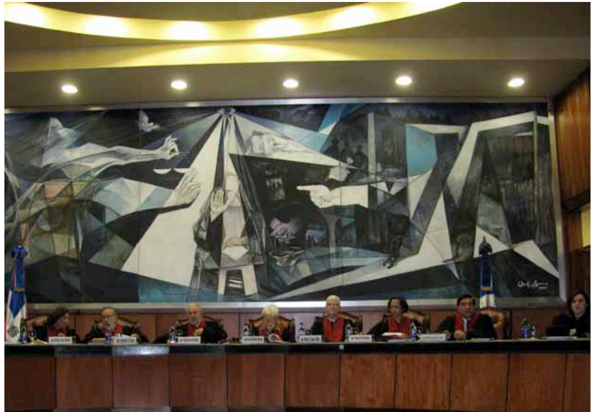
In April 2009, the Inter-American Court of Human Rights held session in the Dominican Republic where it heard the case of Kenneth Ney Anzualdo vs. Peru litigated by CEJIL and APRODEH

After years of attempting to move the idea forward, finally in 2008 the OAS General Assembly approved the creation of the Fund and, in November 2009, the OAS Permanent Council approved the rules of operation.