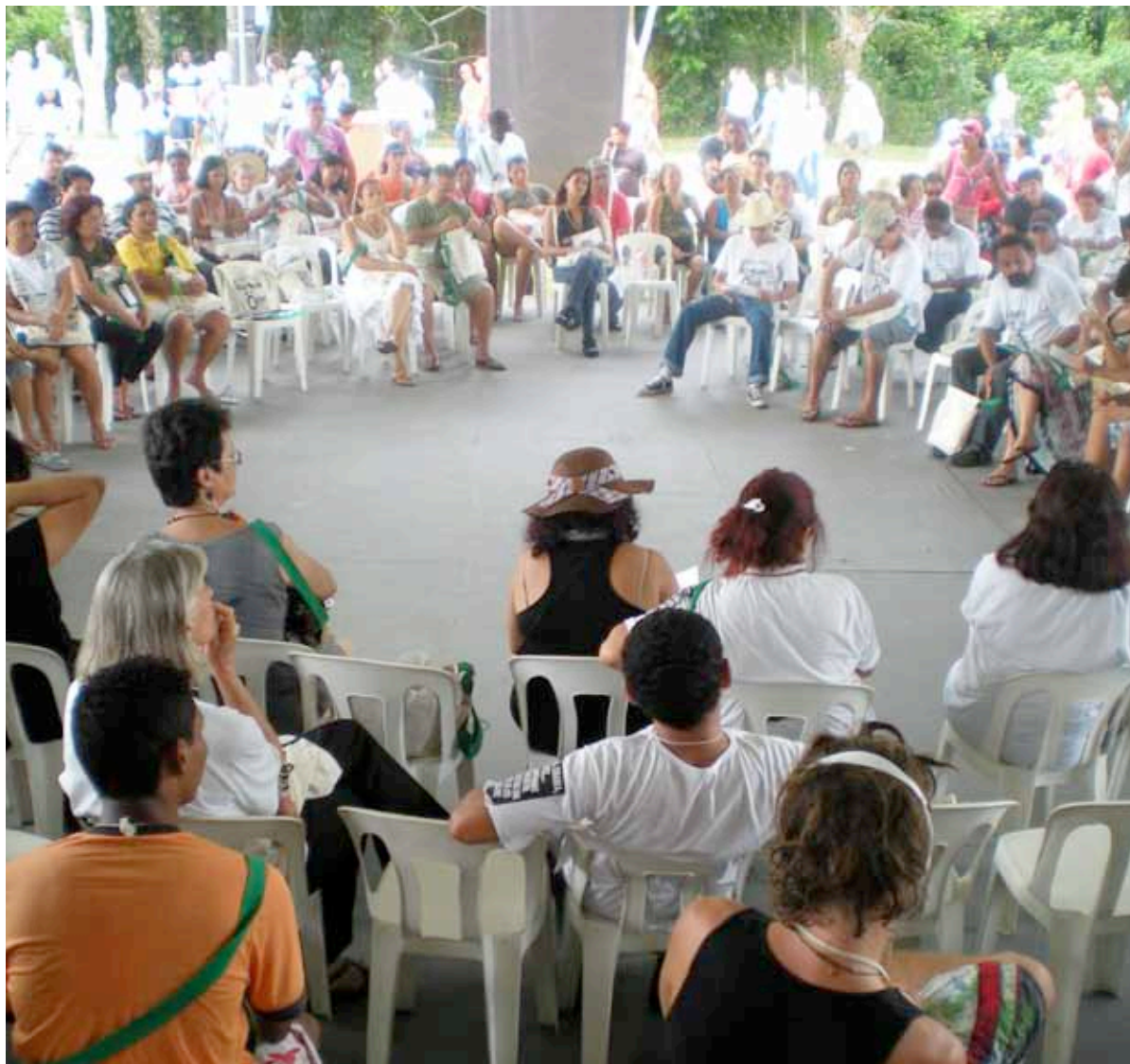
CEJIL took part in a talk entitled "The right to truth and memory" on repealing the Brazilian Amnesty Law. The event was part of the World Social Forum held in Belem in the State of Para (Brazilian Amazon) on January 30, 2009.

Due to the failure to implement the recommendations issued in its Merits Report, the IACHR brought the case before the Inter-American Court of Human Rights in March 2009.